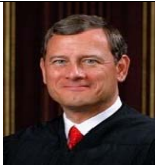
John G. Roberts, Jr. (1955--), Chief Justice since September 29, 2005, will administer the oath of office at his first Presidential Inauguration on January 20 th . If he is still on the Bench in 2045, Roberts will break Marshall's record for administering that oath of office.

Although a person today clearly has to exert a great deal of personal effort in order to attain the office, Madison's speech leaves one thinking that he had taken on the role miraculously at the request of the electorate acting in unison as he turned to assert that he realized “the honor and the responsibility” of the role “allotted” to him.